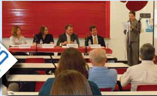
Panelists discuss healthy communities and the future of Kenton County at the June 14 public meeting.

before the market increased sharply and then declined.