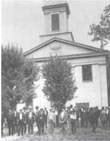
Historic photo of the previous Independence Courthouse

Come celebrate the history of Kenton County as the Independence Courthouse turns 100 years old in October! The Independence Courthouse Centennial Celebration will take place on Friday, October 12 from 5-8 pm and Saturday, October 13 from 9 am-5 pm. The event is free to the public and will feature ongoing tours of the historic Courthouse, including the seldom seen second floor, along with local history exhibits. Additional events will include craft vendors, the Independence Farmers' Market, a veterans' presentation, antique cars,