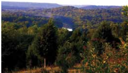
Mist over the newly acquired land near Morning View, Kentucky.

Work continues on the land acquired near Morning View through the Kentucky Heritage Land Conservation Fund Board. Over the past year, efforts have concentrated on removing old farm dumps and other debris including that from tornado damage. In 2011, the Ky. Department for Environmental Protection, Division of Waste Management at the Florence Regional Office chose the site for their Commonwealth Cleanup Week project. During the week, employees of the regional and state office worked with volunteers to remove over 30 cubic yards of waste and 500 tires from the property. Rumpke Consolidated Companies, Inc. donated several dumpsters for the project. In June, the Conservation District cleaned up two additional dumps, resulting in the removal of over 330 cubic yards of waste material. Metal debris from both cleanups was